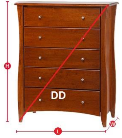
Casegoods diagonal depth DD must be less than the entryway dimension 1 , stairway dimension 3 , 4 , & 8 and all interior doorways 6 or 7