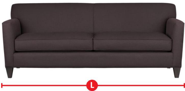
Sofa length L must be less than entryway 1 , stairway dimensions 3 , 4 , & 8 and all interior doorways 6 or 7 .

Casegoods width W must be less than entryway dimensions 1 or 2 , stairway dimensions 3 , 4 & 8 and all interior doorways 6 or 7 .