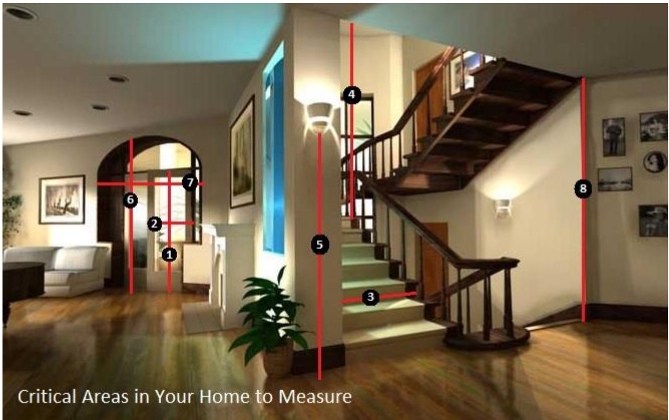
Critical Areas in Your Home to Measure